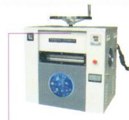
→ A4/A6 LAMINATOR 500/180pcs cards per hour Automatic air and water cooling