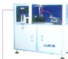
→ AUTOMATIC CARD PUNCHING MACHINE A-4, A-3