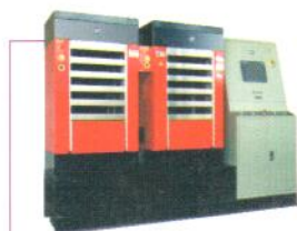
→ WL5200 (PLC) HIGH SPEED LAMINATOR PLC CONTROLLED 5000pcs cards per cycle