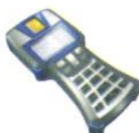
Hand held Devices